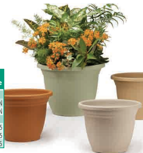
*Also available in Sandstone.