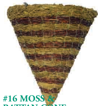
#16 MOSS & RATTAN CONE

Dimensions and capacity are subject to change as products are handmade.