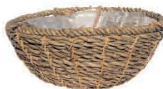
SOLID COLOR RAFFIA - REED