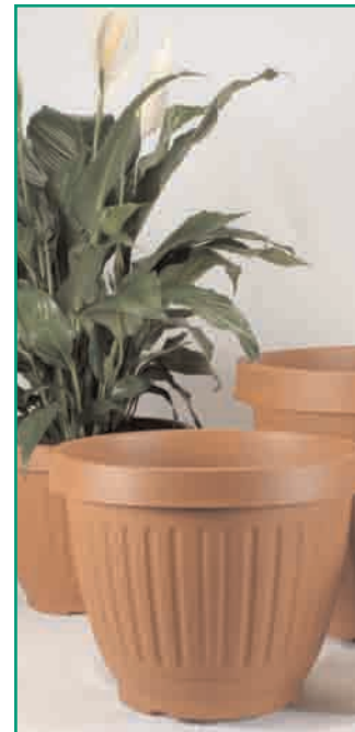
*Also available in Sandstone.

ITML QUANTITY DISCOUNTS 10 cs., less 5% 25 cs., less 10% 50 cs., less 15% Call for further discounts.