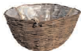
SOLID COLOR VINE