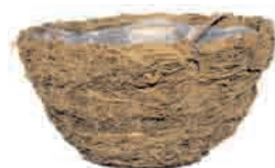
MOSS HANGING BASKET