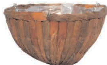
#16 PALM BARRELL