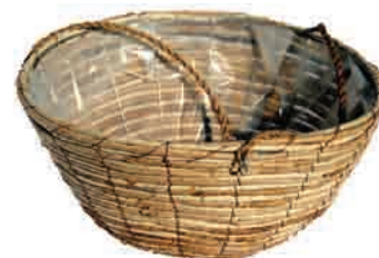
BI-COLOR RAFFIA - REED