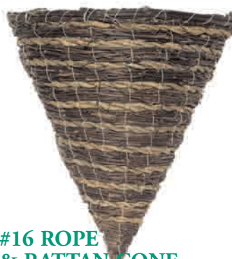
#16 ROPE & RATTAN CONE